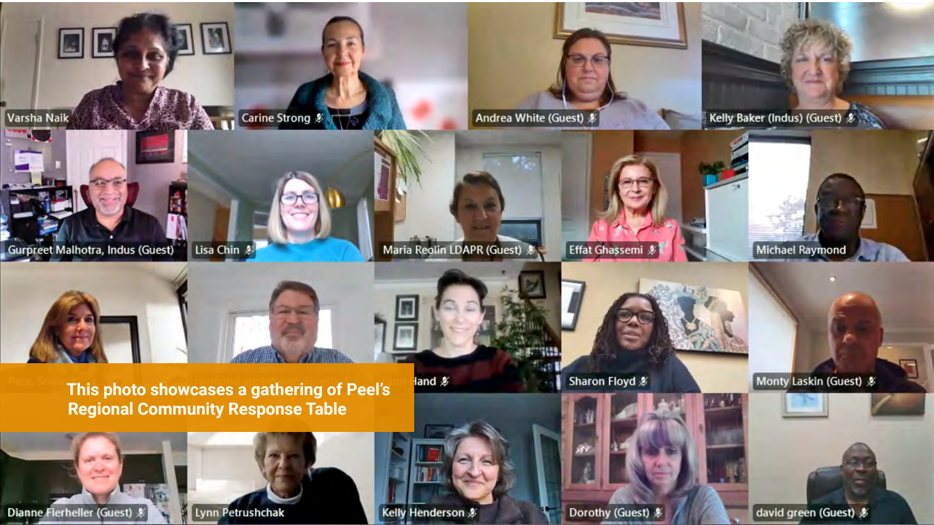
This photo showcases a gathering of Peel's Regional Community Response Table

The virtual CRT includes employees from the Region of Peel and municipal partners from Brampton, Caledon and Mississauga. Participants also include not-for-profits, health, social service and systems organizations such as school boards and health agencies.