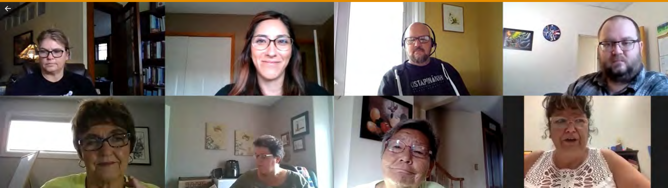
“Collaboration, Sharing and Updating in Covid-19 Times” This is an image of Prince Albert’s networking meetings that now have to take place via Zoom!

The PAUIC includes over 80 Indigenous and non-Indigenous organizations and community members who come together on a monthly basis and share information, heal and reconcile, and address the unique challenges in Prince Albert. The CNC has 450+ local members and was formed by the community in 1999 to enhance communication, prevent duplication of services and to promote collaborative