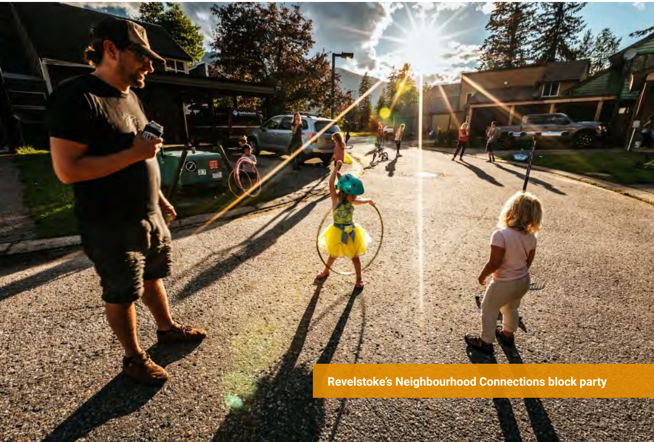
Revelstoke's Neighbourhood Connections block party